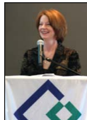
Gillard speaking at this year's ASU State Conference

The Agreement does not mean that the Queensland rates are automatically replicated in the Fair Work Australia system – the ASU and others will still have to run a case before the Fair Work Australia Tribunal. On the upside, everyone involved recognises that if the Queensland case is anything to go by, there will be an outcome and that our governments will have to fund what results from the case and the Federal Government has agreed to co-ordinate discussions with the states about any funding implications.