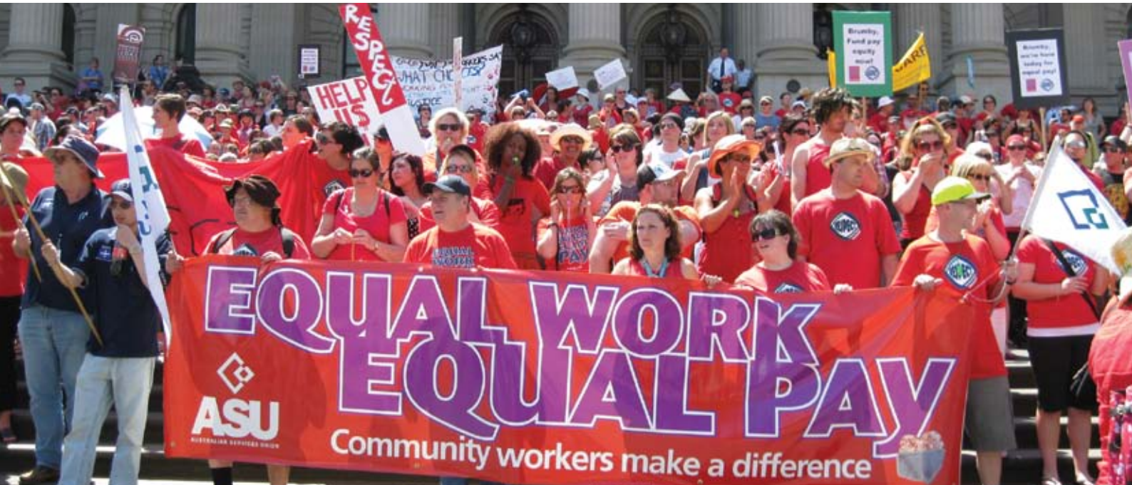
INSIDE: SACS 'Respect' campaign heats up